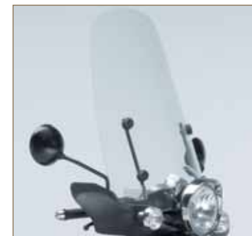
Large windshield (sports windshield and hand guards)

Made for fitting on a Scarabeo GT scooter without having to remove the characteristic hand guards. Provides uncompromising protection that does not detract from the pleasure of riding. Made from top quality materials for maximum safety.