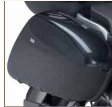
Panniers (with mounting racks)

These panniers come with a practical quick fit and release system and are elegantly finished with lids painted to match your scooter's original colour scheme, because functionality and style go hand in hand at Aprilia. Carrying capacity is also generous at 25 litres per pannier.