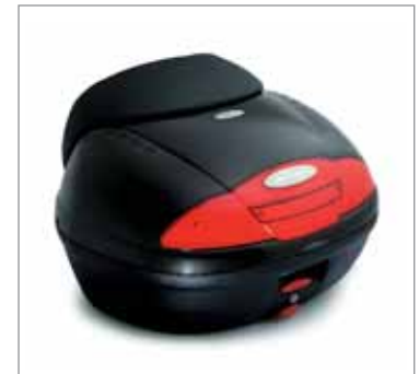
Street Case top box (embossed)

This paint finished top box fits directly on the standard luggage rack. Its ergonomic passenger backrest and generous 45 litre load carrying capacity let you tackle even the longest journeys in total comfort. Practically and style to complement the Atlantic's sleek looks.