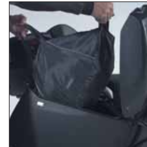
Inner bags for panniers