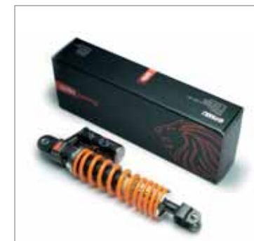
Racing rear shock absorber

Designed to keep the wind off you without detracting from riding pleasure, this sports windshield combines an aggressive new look with maximum rider protection.