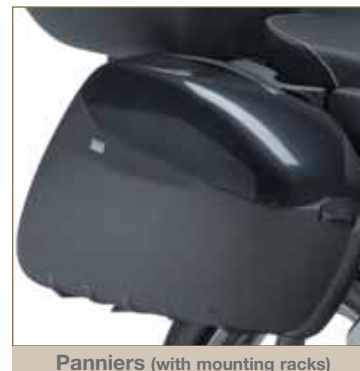
Panniers (with mounting racks)

This leg cover is specially designed for the Scarabeo 125/250. Conceived for comfort and specially manufactured with safety in mind. Conventional straps have been eliminated in favour of Velcro fasteners for maximum freedom of movement. Excellent insulation thanks to high quality materials that combine lightness with total impermeability. With its closed cell and Lycra body material, the leg cover adapts perfectly to riders of all heights.