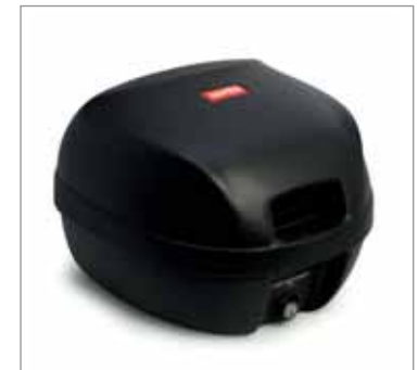
New Concept top box (embossed)

Spacious, stylish and practical, the New Concept top box provides a generous 32 litres of carrying capacity. Its lid is finished to match your scooter's original bodywork for maximum style. Fitting is a piece of cake thanks to the mounting plate cleverly located inside the box itself.