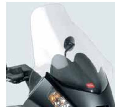
Large windshield with hand guards

This automobile inspired luggage rack is eye-catching finished in retro style chrome. A practical solution for carrying any bag, it is fully compatible with Aprilia's tail bag accessory.