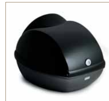
Ovetto top box

Spazio, stile, praticità: un bauletto posteriore di nuova concezione, con un'ottima capacità di carico di 32 litri e un'estetica impeccabile. Il montaggio è semplificato dalla piastra di aggancio contenuta all'interno del baule stesso.