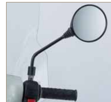
Left hand mirror

Spacious, stylish and practical, the New Concept top box provides a generous 32 litres of carrying capacity with a stylish finish. Fitting is a piece of cake thanks to the mounting plate cleverly located inside the box itself.