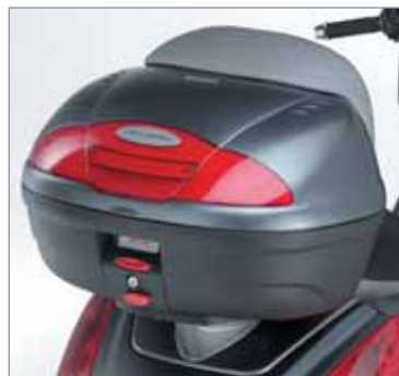
Street Case top box

Spacious luggage and ergonomic passenger backrest rolled into one, this 45 litre top box is specially styled to enhance your Atlantic scooter. The lid is painted to match your scooter's original bodywork.