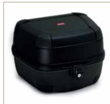
Top box with brackets

This elegantly finished top box provides 26 litres of carrying capacity. Combines with the mounting plate kit.