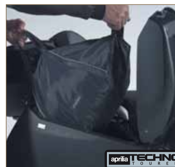
Inner bags for panniers

The large windshield provides maximum rider protection without detracting from riding pleasure. The sports windshield gives your Scarabeo 125/250 an aggressive new look in addition to rider protection. Both windshields can be enhanced with practical hand guards.