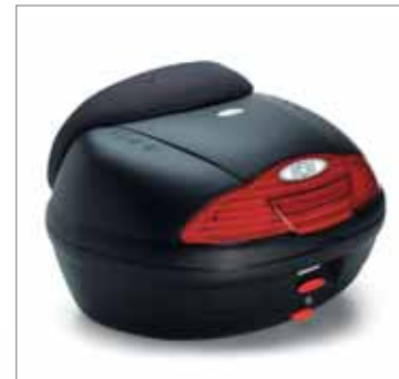
Street Case top box

This paint finished top box fits directly on the standard luggage rack. Its ergonomic passenger backrest and generous 45 litre load carrying capacity let you tackle even the longest journeys in total comfort. Practically and style to complement the Atlantic's sleek looks.