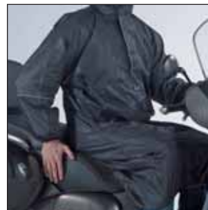
Rider rainproof overall