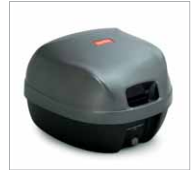
New Concept top box

Combines comfort and riding pleasure. Made from top quality materials for maximum safety. This large windshield provides excellent protection against the weather. A popular accessory designed and made to the same high standards as everything else on your scooter.