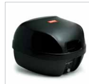
New Concept top box (painted)

Spacious, stylish and practical, the New Concept top box combines a generous 32 litres of carrying capacity with innovative and personal styling. Fitting is a piece of cake thanks to the mounting plate cleverly located inside the box itself.