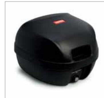
New Concept top box (embossed)

Specially designed for safety and uncompromising protection, this sports windshield is the perfect match for the dynamic lines of your SR Ditech.