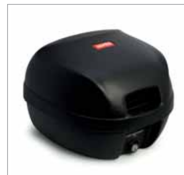
New Concept top box (embossed)

This professional shock absorber provides 4 spring preload settings and hydraulic compression and rebound damping to give your SR enhanced racetrack handling.