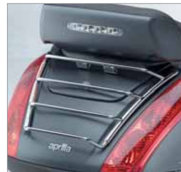
Chrome luggage rack

Spacious luggage and ergonomic passenger backrest rolled into one, this 45 litre top box is specially styled to enhance your Atlantic scooter. The lid is painted to match your scooter's original bodywork.