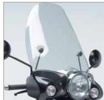
Large windshield (for GT models)

Made from form-hugging materials that adapt precisely to the shape of the seat. Highly waterproof, fast drying and quick and easy to remove. Folds away neatly for storage under the seat.