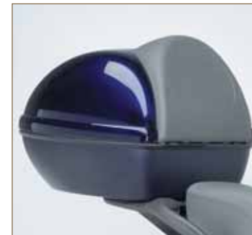
Ovetto top box

Made from top quality materials that guarantee maximum respect for safety. An uncompromising solution designed and made to enhance protection without reducing riding pleasure.