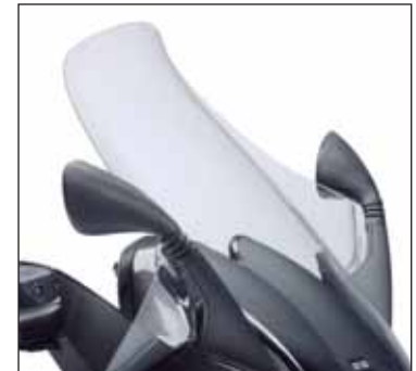
Large windshield with hand guards

This leg cover is specially designed for the Atlantic 125, 250 and 500 Sprint. Conceived for comfort and specially manufactured with safety in mind. Conventional straps have been eliminated in favour of Velcro fasteners for maximum freedom of movement. Excellent insulation thanks to high quality materials that combine lightness with total impermeability. With its closed cell and Lycra body material, the leg cover adapts perfectly to riders of all heights.